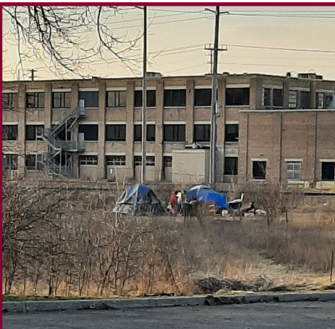
Homeless living in tents by the railroad tracks

"But as for me, I am poor and needy; may the Lord think of me. You are my help and my deliverer; you are my God, do not delay." Psalm 40:17