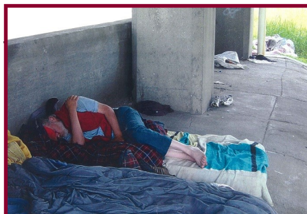
Home under the expressway