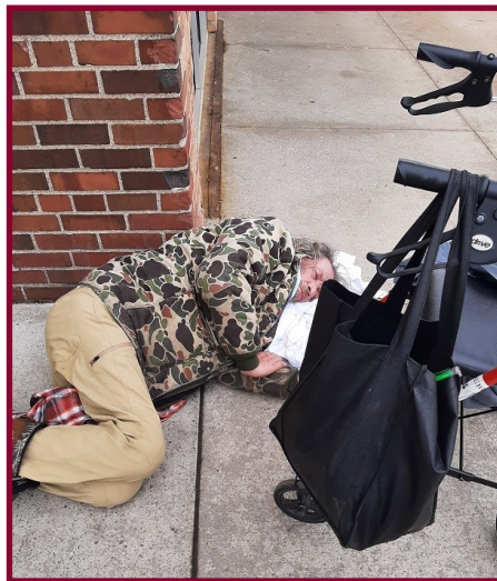
Sleeping it off on the sidewalk

We have a 20 year old young woman for whom we recently became guardian. She is deaf and has limited vision. She has moved into subsidized independent housing and is so excited to be an adult. We feel she would benefit from a Trusted Friend who knows sign language. She has had a difficult childhood and has grown up in the foster care system. She is a very sweet and excitable girl. Please contact us if you would like to know more about being her Trusted Friend. Give us a call at (616) 456-8512 or send us an email to scgr@scgr.org .