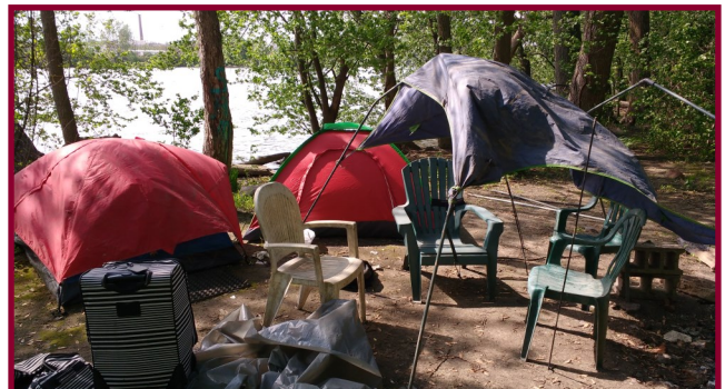
A homeless camp along the Grand River

Please help us expand our services to the homeless and mentally ill with your financial gift. Will you consider making your gift a regular monthly or quarterly gift?