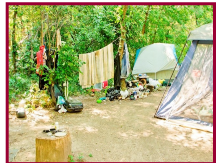
A Homeless Camp in the Woods