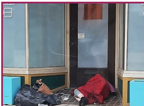
Sleeping in a Store Alcove

Please help us expand our services so we may help more homeless and mentally ill individuals. Will you consider making a regular monthly or quarterly gift?