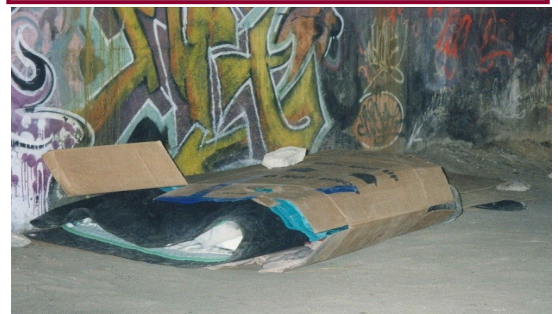
Cardboard adds insulation to this sleeping bag.

We would like to add a Client Specialist by next spring, or sooner. Our goal is to raise $38,000. Will you help us reach this goal?