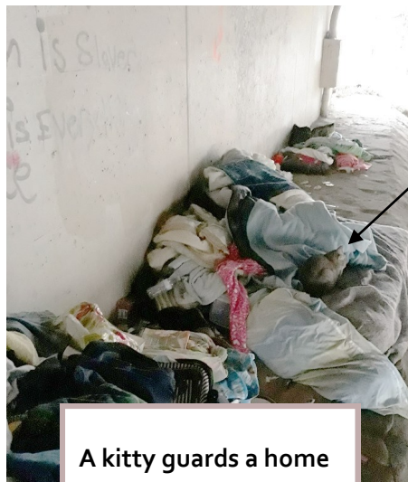
A kitty guards a home under an overpass.