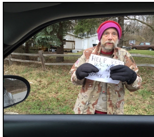
When asked what the money was for, he replied, "I gotta get me some coffee, man!"

folks who cannot help themselves. I think Paul includes them in the latter portion of 1 Thessalonians 5:14, "encourage the timid...help the weak." The scholars of New Testament Greek tell us this passage refers to people with "small psyche", the root